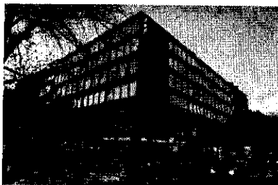
Cladirea e ABF-ul

The location was ABF Arbetarnas Bildningsförbund – a centre for social and cultural activities, the organizer prepared quite a large agenda presentations of different stakeholders of this topic in Sweden. We could be informed about the